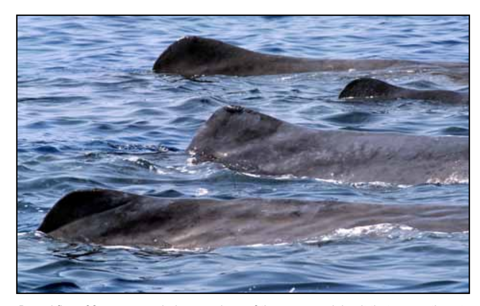
Dorsal fins of four sperm whales members of the same social unit that are resting at surface. Calluses are visible on the top of the three largest fins that belong to mature females.

The live stranding in southern Italy in December 2009 of seven sperm whales in an apparent state of starvation is at the same time puzzling and worrisome. Puzzling because although not much is known about biomass and distribution of mesopelagic squid in the Mediterranean, which constitute most of the diet of sperm whales in the region, until now there never was reason to doubt that there was ample availability of these mollusks. Worrisome because of the suspicion that there might be a connection between dearth of squids and the intense seismic surveys that had been conducted in area at the time of the stranding, coupled with the notion that seismic surveys can have detrimental effects of squid in a wide area. Unfortunately, the abundance and distribution of deep water squid are difficult and expensive to investigate, and current knowledge and research