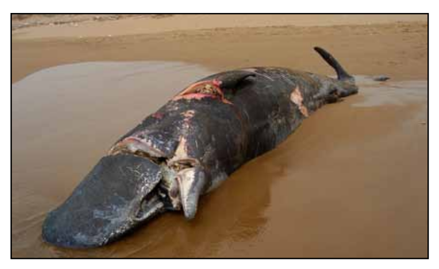
A sperm whale with propeller marks on its body stranded in W Peloponnese (Hellenic Trench) after a collision with a large vessel. Ship strikes seriously threaten the endangered Mediterranean sperm whales.

Propeller marks or cut flukes have been observed on several photo-identified sperm whales in both the western and eastern Mediterranean basins. The known number of sperm whale ship strikes in Greece depicts well the size of the problem. Of the 19 sperm whales examined out of the 23 stranded since 1997, at least 11 (58%) had collision marks on their bodies indicating a ship strike as the likely cause of death. As with driftnets, this figure does not include animals killed by ships whose carcasses never reached the coasts. Such a high death toll is likely to be unsustainable for a sub-population that may not contain more than 200-250 individuals.