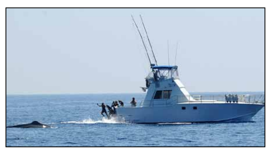
A leisure boat observed harassing a sperm whale in the Mediterranean - an increasing threat.

In this article we tell the story of a population of sperm whales that happens to have elected the Mediterranean, a semi-enclosed sea, as their residence. Many find it surprising that sperm whales, so typically oceanic, are capable of making a living in a relatively small marine basin such as the Mediterranean, locked within the landmasses of three continents, and affected by human activities of many types. In fact, in spite of its small size compared to the oceans, the Mediterranean Sea offers abundant habitat suitable to sperm whales'